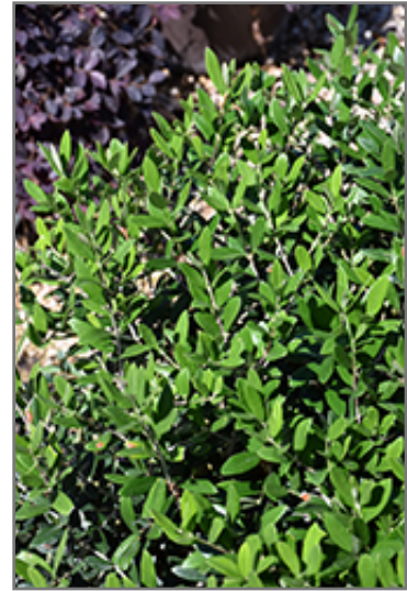
Little Ollie® Dwarf Olive foliage

Little Ollie® Dwarf Olive makes a fine choice for the outdoor landscape, but it is also well-suited for use in outdoor pots and containers. With its upright habit of growth, it is best suited for use as a 'thriller' in the 'spiller-thriller-filler' container combination; plant it near the center of the pot, surrounded by smaller plants and those that spill over the edges. It is even sizeable enough that it can be grown alone in a suitable container. Note that when grown in a container, it may not perform exactly as indicated on the tag - this is to be expected. Also note that when growing plants in outdoor containers and baskets, they may require more frequent waterings than they would in the yard or garden.