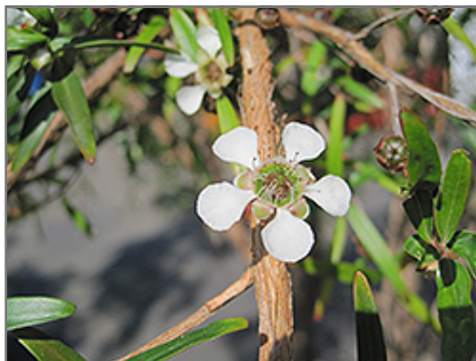
Lemon Scented Tea-Tree flowers