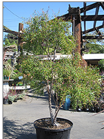
Lemon Scented Tea-Tree

Lemon Scented Tea-Tree is a dense multi-stemmed evergreen tree with an upright spreading habit of growth. Its relatively fine texture sets it apart from other landscape plants with less refined foliage.