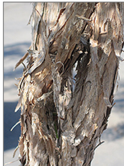
Lemon Scented Tea-Tree bark

Lemon Scented Tea-Tree is a fine choice for the yard, but it is also a good selection for planting in outdoor pots and containers. Its large size and upright habit of growth lend it for use as a solitary accent, or in a composition surrounded by smaller plants around the base and those that spill over the edges. It is even sizeable enough that it can be grown alone in a suitable container. Note that when grown in a container, it may not perform exactly as indicated on the tag - this is to be expected. Also note that when growing plants in outdoor containers and baskets, they may require more frequent waterings than they would in the yard or garden.