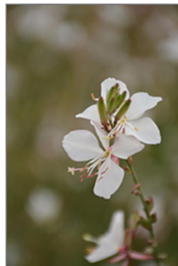
Geyser White Gaura flowers

Geyser White Gaura is recommended for the following landscape applications;