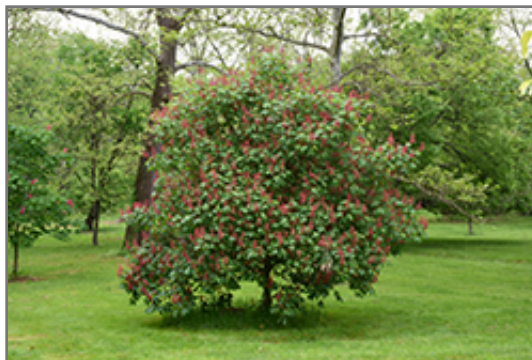
Splendens Red Buckeye in bloom