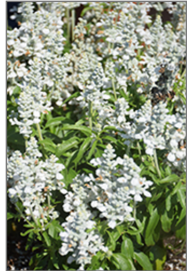
Mannequin Snow Mountain Salvia flowers

This plant will require occasional maintenance and upkeep, and should be cut back in late fall in preparation for winter. It is a good choice for attracting butterflies and hummingbirds to your yard, but is not particularly attractive to deer who tend to leave it alone in favor of tastier treats. It has no significant negative characteristics.