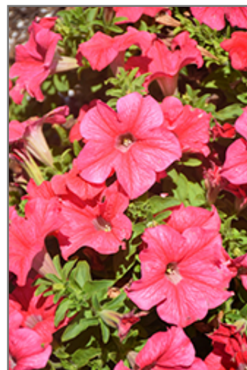
Panache Coral Reef Petunia flowers

Panache Coral Reef Petunia is a fine choice for the garden, but it is also a good selection for planting in outdoor containers and hanging baskets. It is often used as a 'filler' in the 'spiller-thriller-filler' container combination, providing a mass of flowers against which the thriller plants stand out. Note that when growing plants in outdoor containers and baskets, they may require more frequent waterings than they would in the yard or garden.