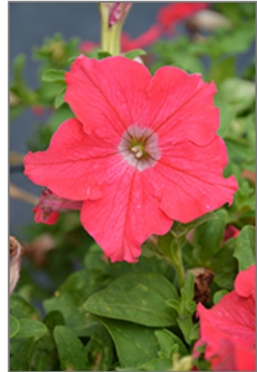
Panache Coral Reef Petunia flowers

Panache Coral Reef Petunia is recommended for the following landscape applications;