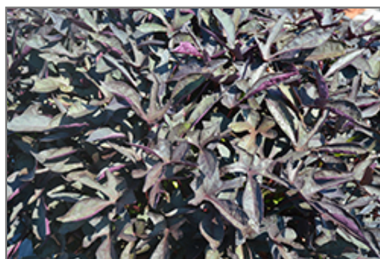
South of the Border Black Beans Sweet Potato Vine foliage