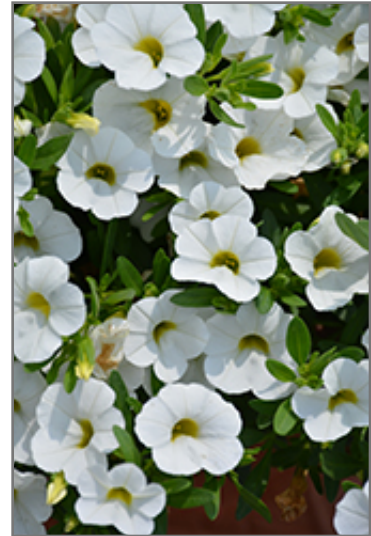
Catwalk Pure Cotton Calibrachoa flowers

Catwalk Pure Cotton Calibrachoa is a dense herbaceous annual with a trailing habit of growth, eventually spilling over the edges of hanging baskets and containers. Its medium texture blends into the garden, but can always be balanced by a couple of finer or coarser plants for an effective composition.