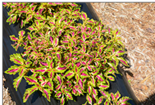
Terra Nova Jitters Coleus