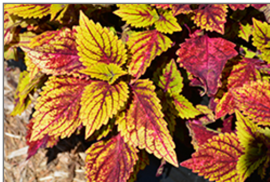
Color Clouds Hottie Coleus foliage

Color Clouds Hottie Coleus is recommended for the following landscape applications;