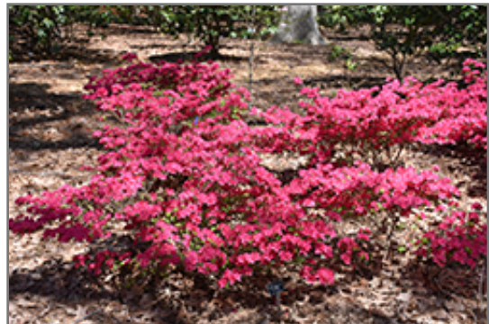
Hinode-giri Azalea in bloom