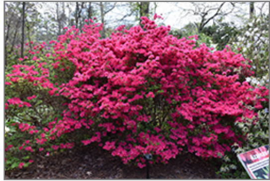
Hinode-giri Azalea in bloom

This shrub does best in full sun to partial shade. You may want to keep it away from hot, dry locations that receive direct afternoon sun or which get reflected sunlight, such as against the south side of a white wall. It requires an evenly moist well-drained soil for optimal growth, but will die in standing water. It is very fussy about its soil conditions and must have rich, acidic soils to ensure success, and is subject to chlorosis (yellowing) of the foliage in alkaline soils. It is somewhat tolerant of urban pollution, and will benefit from being planted in a relatively sheltered location. Consider applying a thick mulch around the root zone in winter to protect it in exposed locations or colder microclimates. This particular variety is an interspecific hybrid.