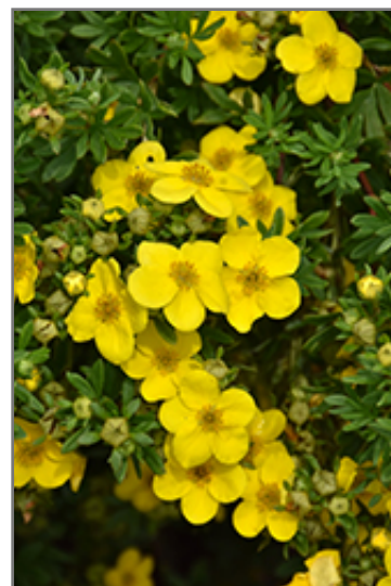
Happy Face Yellow Potentilla flowers

Happy Face Yellow Potentilla is recommended for the following landscape applications;