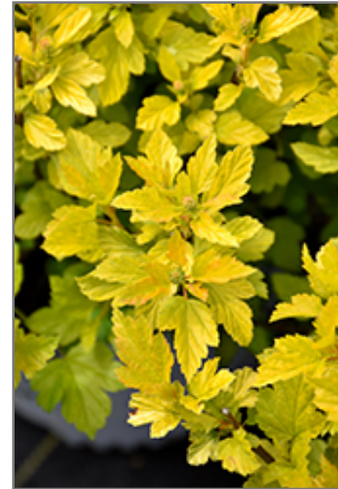
Tiny Wine Gold Ninebark foliage

Tiny Wine Gold Ninebark is recommended for the following landscape applications;