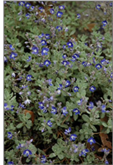
Scalloped-leaf Speedwell flowers