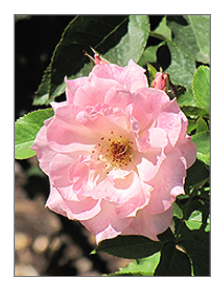
First Kiss Rose flowers