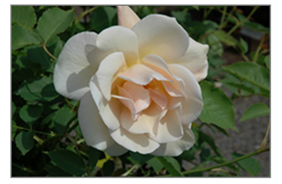
First Kiss Rose flowers

This shrub will require occasional maintenance and upkeep, and is best pruned in late winter once the threat of extreme cold has passed. It is a good choice for attracting bees to your yard. Gardeners should be aware of the following characteristic(s) that may warrant special consideration;