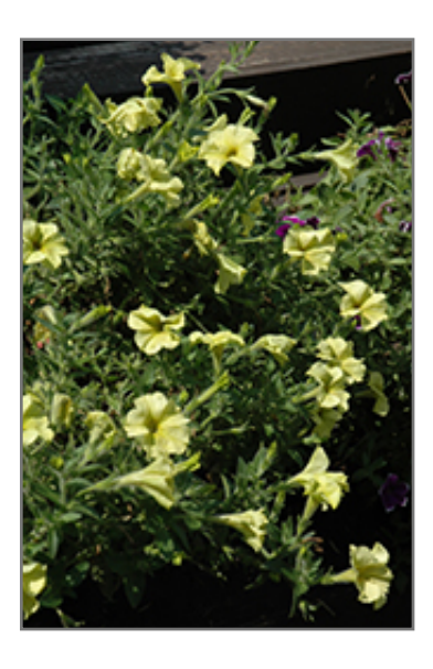
Happy Classic Marble Yellow Petunia flowers