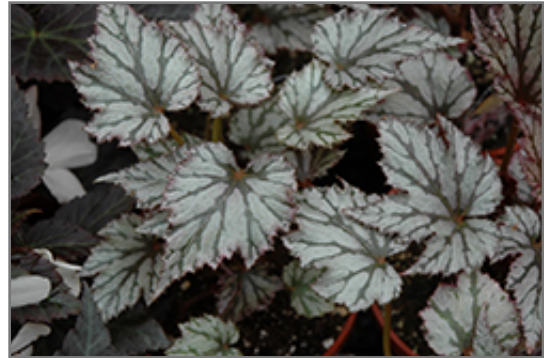
Garden Angel Plum Begonia foliage

This large, mounded variety quickly creates a dense, full specimen; stunning silver leaves with dark gray-green veins and a plummy-red violet cast; grown primarily for foliage, pink flowers are subtle; perfect for window boxes and light shade gardens