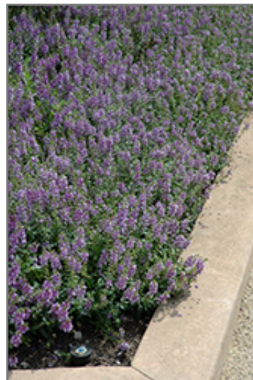
Serenita Sky Blue Angelonia in bloom

Serenita Sky Blue Angelonia is a fine choice for the garden, but it is also a good selection for planting in outdoor containers and hanging baskets. It is often used as a 'filler' in the 'spiller-thriller-filler' container combination, providing a mass of flowers against which the larger thriller plants stand out. Note that when growing plants in outdoor containers and baskets, they may require more frequent waterings than they would in the yard or garden.