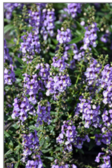
Serenita Sky Blue Angelonia flowers

Serenita Sky Blue Angelonia is an herbaceous annual with an upright spreading habit of growth. Its relatively fine texture sets it apart from other garden plants with less refined foliage.