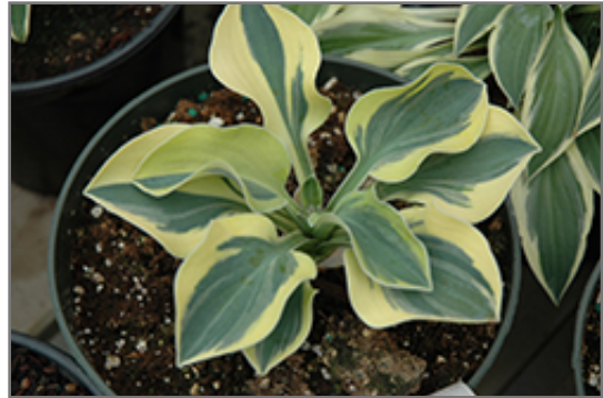
Lucky Mouse Hosta foliage