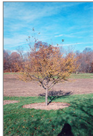
Winter Gold Flowering Crab fruit

Winter Gold Flowering Crab is recommended for the following landscape applications;