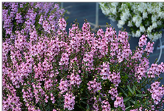
Serenita Pink Angelonia in bloom