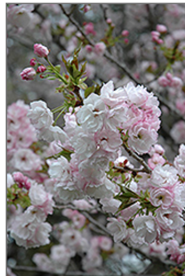
Manoga Flowering Cherry flowers

Manoga Flowering Cherry is recommended for the following landscape applications;