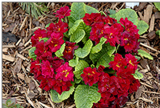
Corporal Baxter Primrose in bloom