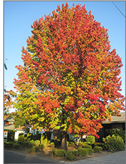
Lane RobertsSweet Gum in fall

Lane RobertsSweet Gum is recommended for the following landscape applications;