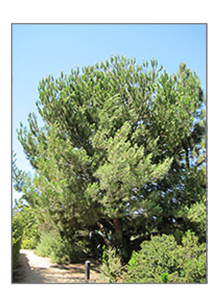
Stone Pine