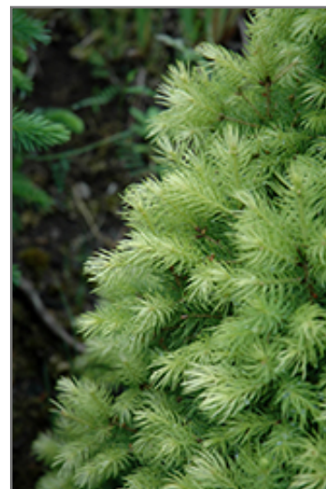
J.W. Daisy's White Alberta Spruce foliage