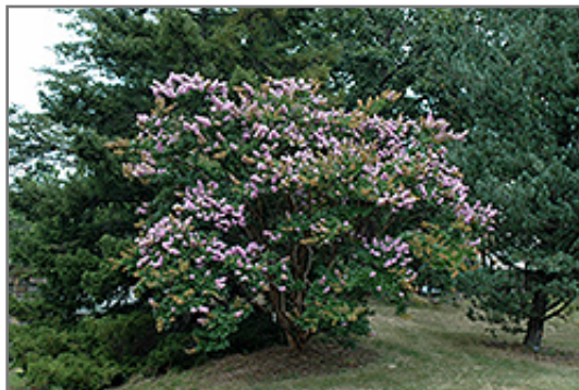
Yuma Crapemyrtle in bloom