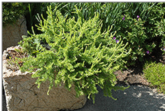
Darling Susie Larch