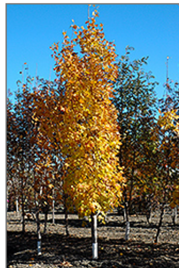
Lord Selkirk Sugar Maple in fall