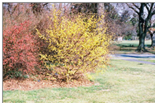
Spring Glow Cornelian Cherry Dogwood in bloom

Spring Glow Cornelian Cherry Dogwood is recommended for the following landscape applications;