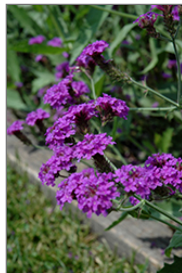
Santos Purple Verbena flowers

Santos Purple Verbena is recommended for the following landscape applications;