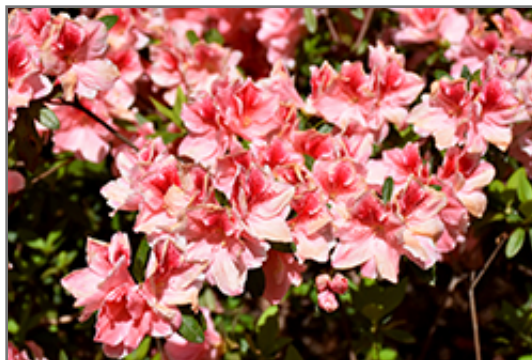
Gloria Azalea flowers