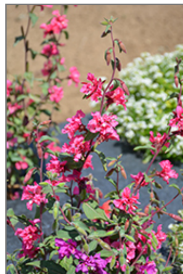
Sriracha Rose Cuphea flowers