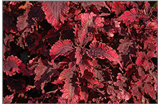
Mississippi Summer Coleus foliage

Mississippi Summer Coleus will grow to be about 30 inches tall at maturity, with a spread of 12 inches. When grown in masses or used as a bedding plant, individual plants should be spaced approximately 9 inches apart. Although it's not a true annual, this fast-growing plant can be expected to behave as an annual in our climate if left outdoors over the winter, usually needing replacement the following year. As such, gardeners should take into consideration that it will perform differently than it would in its native habitat.