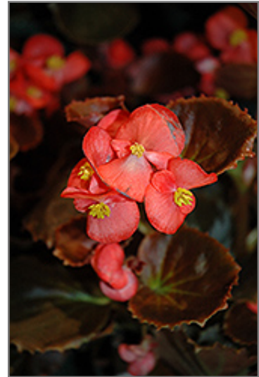
Nightife Red Begonia flowers

This is a high maintenance plant that will require regular care and upkeep, and usually looks its best without pruning, although it will tolerate pruning. Deer don't particularly care for this plant and will usually leave it alone in favor of tastier treats. Gardeners should be aware of the following characteristic(s) that may warrant special consideration;