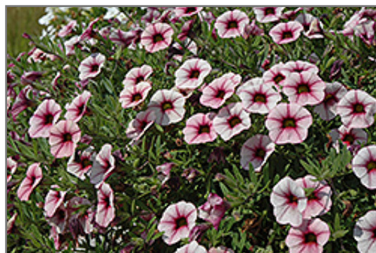
MiniFamous iGeneration Rose Vein Calibrachoa flowers

MiniFamous iGeneration Rose Vein Calibrachoa is recommended for the following landscape applications;