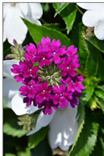
Superbena Royale Plum Wine Verbena flowers