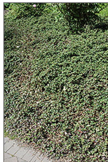
Formosan Carpet Creeping Taiwan Bramble