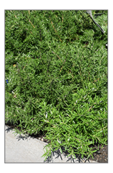
Roman Beauty Rosemary

Aside from its primary use as an edible, Roman Beauty Rosemary is sutiable for the following landscape applications;