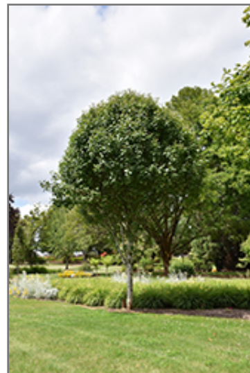
Jack Ornamental Pear

This tree should only be grown in full sunlight. It prefers to grow in average to moist conditions, and shouldn't be allowed to dry out. It is not particular as to soil type or pH. It is highly tolerant of urban pollution and will even thrive in inner city environments. This is a selected variety of a species not originally from North America.