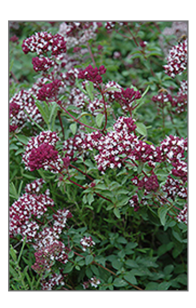
Zorba Red Oregano flowers

Aside from its primary use as an edible, Zorba Red Oregano is sutiable for the following landscape applications;