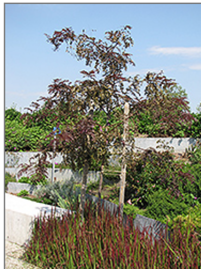
Ruby Lace Honeylocust

This tree should only be grown in full sunlight. It is very adaptable to both dry and moist locations, and should do just fine under average home landscape conditions. It is not particular as to soil type or pH, and is able to handle environmental salt. It is highly tolerant of urban pollution and will even thrive in inner city environments. This is a selection of a native North American species.