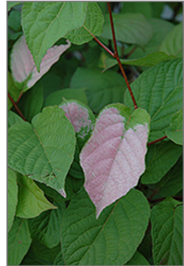
September Sun Kiwi foliage

September Sun Kiwi is recommended for the following landscape applications;