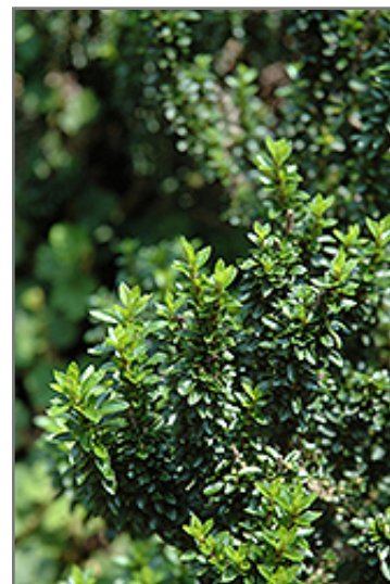
Sapporo Serissa foliage