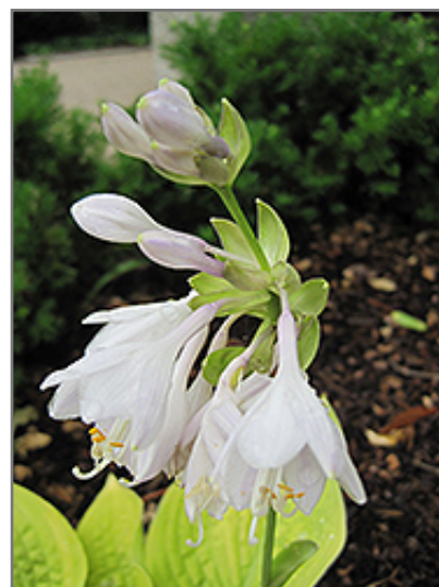
English Sunrise Hosta flowers