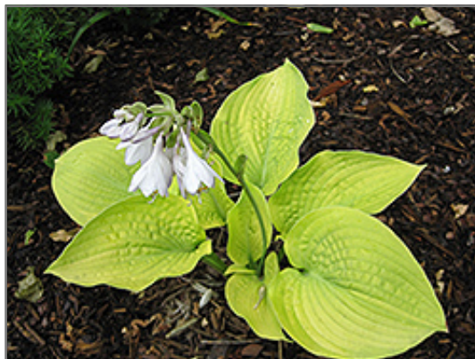
English Sunrise Hosta