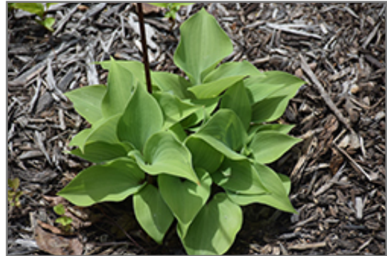
Cinnamon Sticks Hosta

Cinnamon Sticks Hosta is recommended for the following landscape applications;