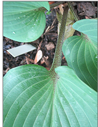
Cinnamon Sticks Hosta foliage