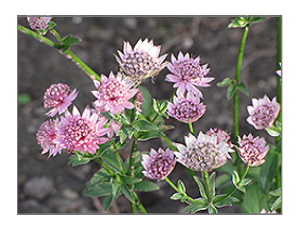
Primadonna Masterwort flowers