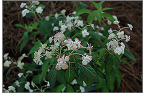
Shirotae Hydrangea flowers

Shirotae Hydrangea will grow to be about 4 feet tall at maturity, with a spread of 3 feet. It has a low canopy. It grows at a medium rate, and under ideal conditions can be expected to live for approximately 30 years.