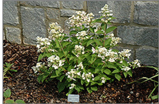
Dharuma Hydrangea in bloom

This shrub does best in full sun to partial shade. It prefers to grow in average to moist conditions, and shouldn't be allowed to dry out. It may require supplemental watering during periods of drought or extended heat. It is not particular as to soil type, but has a definite preference for acidic soils. It is highly tolerant of urban pollution and will even thrive in inner city environments. Consider applying a thick mulch around the root zone in winter to protect it in exposed locations or colder microclimates. This is a selected variety of a species not originally from North America.