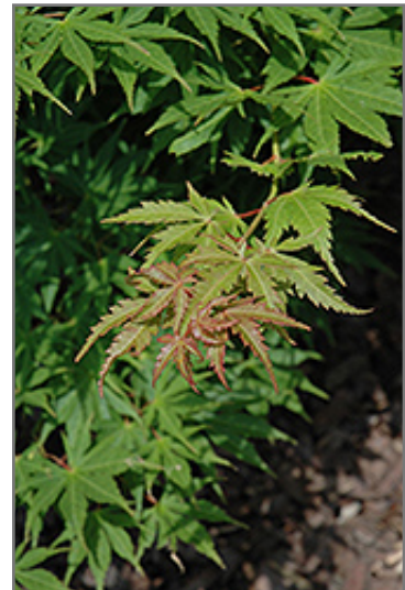
Yellow Bird Japanese Maple foliage